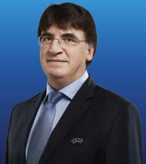
Theodore Theodoridis UEFA General Secretary

Our aim is to promote social responsibility at all levels of football and in all areas of the game. The UEFA FSR compact course provides key FSR practitioners with the necessary skills and knowledge to continue developing and integrating FSR into football activities across Europe.