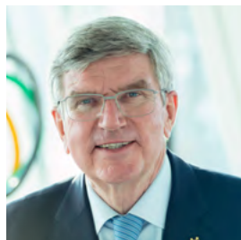
Thomas Bach IOC President and Olympic Champion, Fencing

IMD, the IOC, and UEFA have teamed up to bring best-in-class experts and industry professionals to look at sporting events from a different angle and be at the forefront of the changes to come in this fascinating industry. We believe that the greatest innovations in sport will come from strategic collaborations. Industry leaders and external players like yourself are essential for the future of sport.