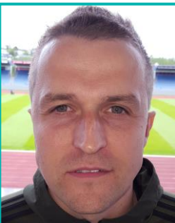
Gunnar Jarl Jónsson